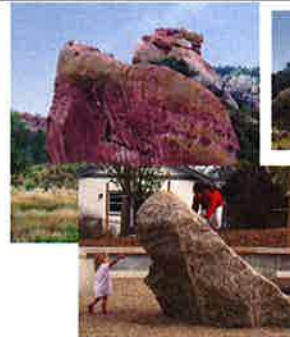
"SANDSTONE OUTCROPPING" CLIMBING BOULDERS