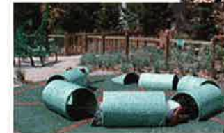
RATTLESNAKE CLIMBING SCULPTURE