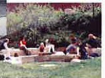
STORY CIRCLE/CHILDREN'S SEATING AREA