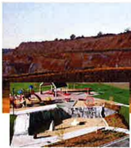
"CLAY MINE" CLIMBING WALL